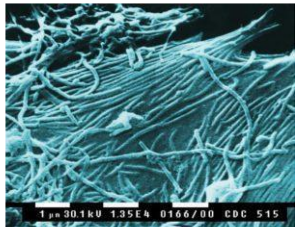
Ebola virions

Antibodies are the correlate of protection in most of the available, effective anti-viral vaccines. Therefore, it is important to understand the role antibodies play in the pathogenesis and prevention of Ebola virus. This study shows that antibodies from an Ebola survivor are capable of having potent anti-viral activity. This research may help in Ebola immunogen design.