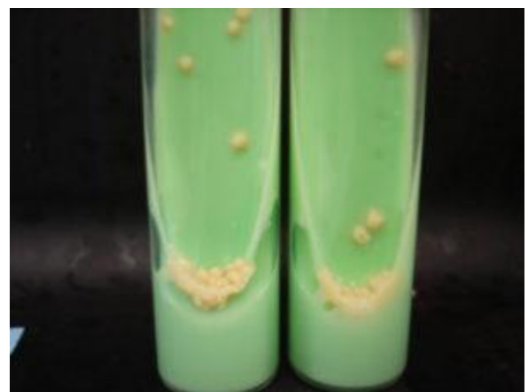
M.tuberculosis on Lowenstein-Jensen media

Mycobacterium tuberculosis ( Mtb ) is a bacterium responsible for Tuberculosis disease. Mtb infection results in months of antibiotic treatment due to the survival of a small subset of bacteria. The bacterium created variability after each cell division, with the progeny having difference growth rates and sizes. Scientists have identified a gene, lamA , whose deletion results in the elimination of heterogeneous Mtb populations. This finding has implications in TB therapy as a less heterogeneous Mtb population may require shorter treatment regimes.