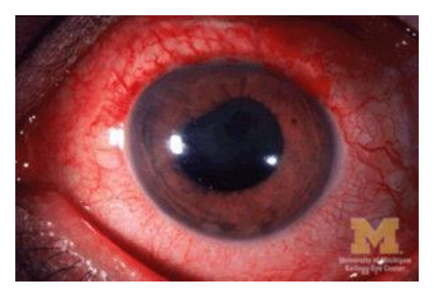
Anterior uveitis

Immune-mediated inflammation of the uvea is one of the major causes of uveitis. Recent studies have linked intestinal microbiomes and their metabolites to the pathogenesis of various immune-mediated diseases. For example, Short Chain Fatty acid (SCFAs), metabolites produced by Firmicutes bacteria during dietary fibre fermentation are known to play a protective role in various immune-mediated diseases through expansion of regulatory T cells (Tregs) or by maintaining the integrity of the intestinal epithelial barrier. In this article, the researchers used inducible experimental autoimmune uveitis (EUA), a T-cell-mediated autoimmune disease model induced by immunization with uveitogenic retinal antigens or by a passively transferring T cells against