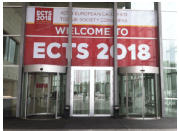
ECTS 2018.

From 26 to 29 May 2018, the 45th Congress of the European Calcified Tissue Society (ECTS) took place in the Spanish city of Valencia. The ECTS Congress is considered the most important European research event in the musculoskeletal field. This annual international conference allows researchers and clinicians working in the field of bones the opportunity to meet and discuss the latest developments in research and patient care.